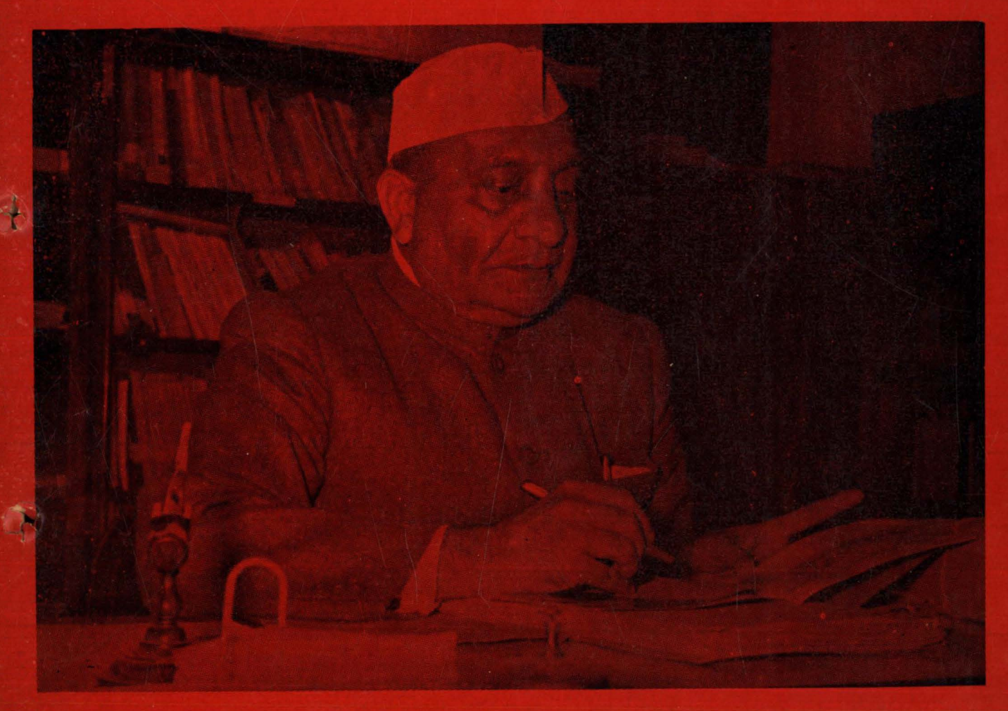
Founder President-the Dedicated Soul.