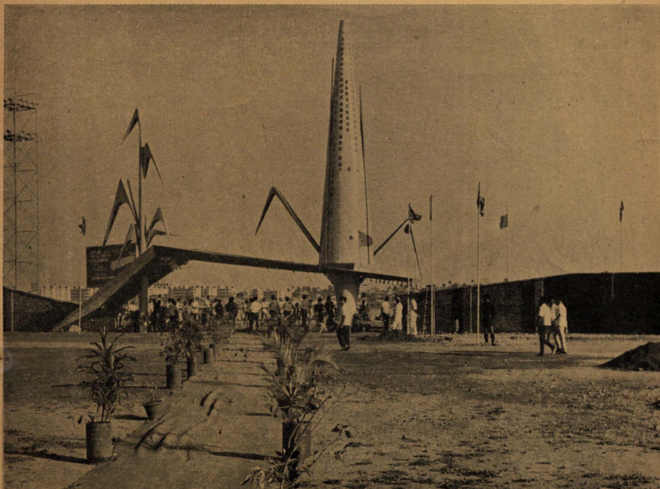
Main Entrance of the Fifth National Agriculture Fair