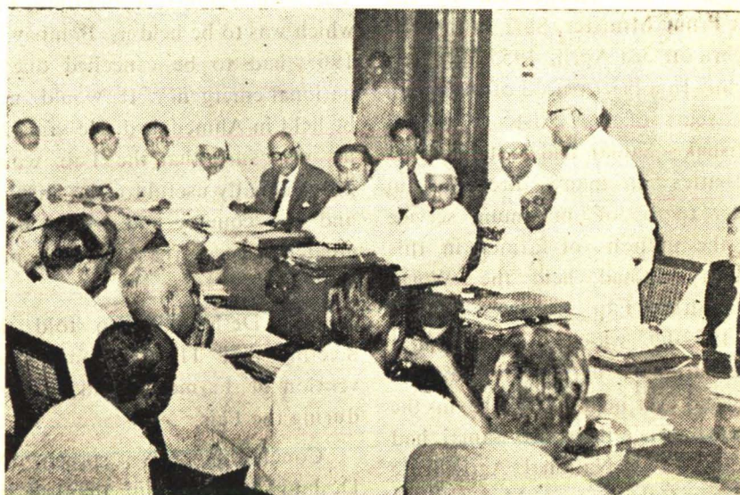
Shri Balwantray Mehta, Chief Minister of Gujarat addressing the first meeting of the Local Advisory Committee of the Third National Agriculture Fair, Ahmedabad

Mr. Mehta congratulated the Bharat Krishak Samaj for its multifarious activities in the service of the farmers, especially in the matter of disseminating knowledge of improved methods of agriculture by organising Agriculture Fairs. He said that the World Agriculture Fair and the two National Agriculture Fairs organized by the Samaj had played a valuable role in the field of agriculture in India and he was sure that the Fair in Ahmedabad would prove even a greater success. He said that he understood from Dr. Deshmukh's speech that ten State Governments had already agreed to participate in the Fair, but he would like all the State Governments to participate in the Fair so that the Gujarat farmers could benefit from the experience of other States, especially Punjab and Madras, where farmers had made good progress in agriculture. Similarly Gujarat had also made good progress in agriculture which would be